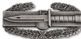
COMBAT ACTION BADGE

This idea deserves consideration for the many non-infantry personal involved in combat in WWII, Korean, and Vietnam—especially those soldiers wounded in combat (awarded the Purple Heart Medal). I hope that one day this will happen.